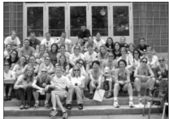
The PT Class of 2001 gathers at the Union Terrace for a celebration.