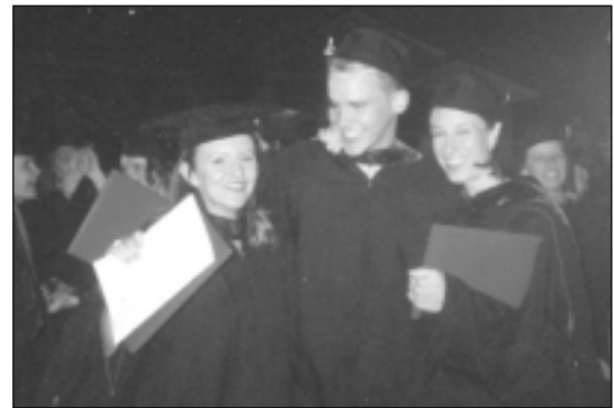
New graduates proudly grasp their diplomas after the graduation ceremony.