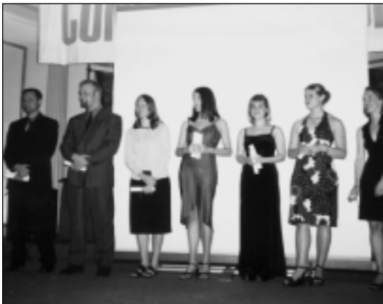
Scholarship recipients are recognized at the Class of 2002 Graduation Banquet.