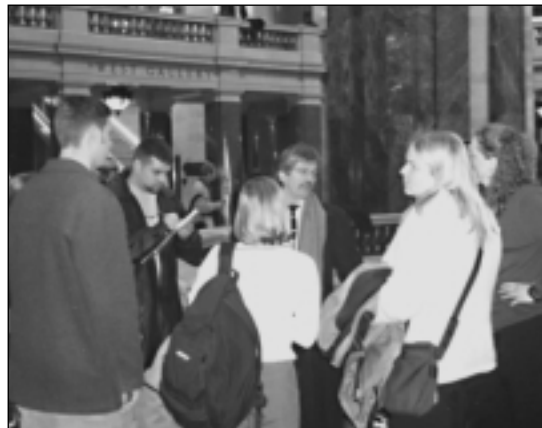
Students discuss the PT Practice Act Bill and prepare to speak with senators at Legislative Day.