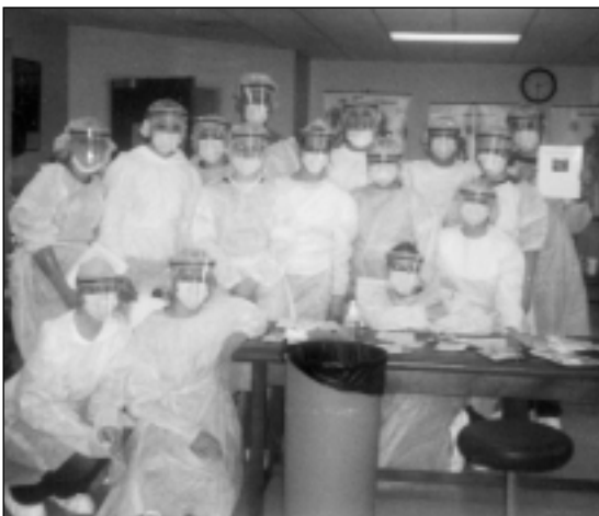
Students prepare to spend time in the Intensive Care Unit (ICU).