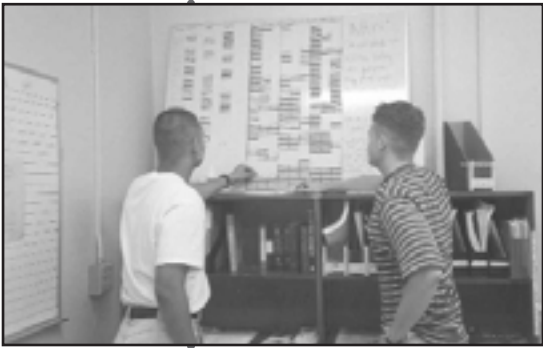
Students study the clinical education board and plan their final internships.