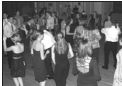
Students, family and friends enjoy the dance at the graduation banquet.