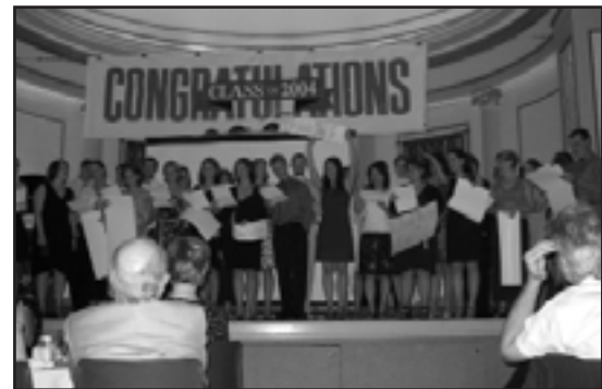
The Class of 2004 composed a song to the tune of "The 12 days of Christmas" that described their fondest memories of PT school. The entire class sang it at the graduation banquet in May.