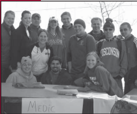
Students gather at the registration table prior to the Bucky Race for Rehab.