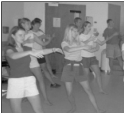
Students focus on correct posture and breathing control in the practice of Tai Chi.