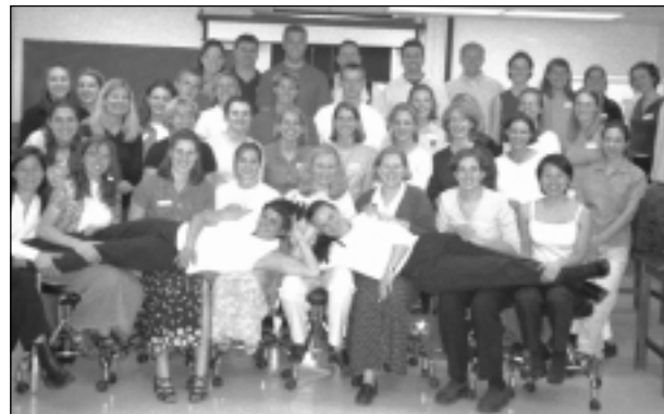
Students celebrate the completion of videography project poster presentations.