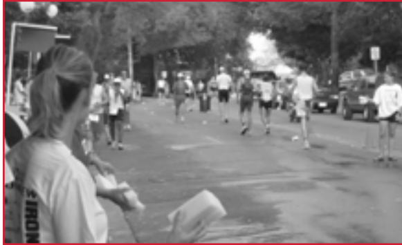
Students Volunteer at the Ironman Triathlon

National PT Month (October) was celebrated through many activities, including an open house for the UW-Madison Kinesiology Club, the annual Bucky Race for Rehab, the selling of Bucky Books, a clothing sale, and a massage fundraiser.