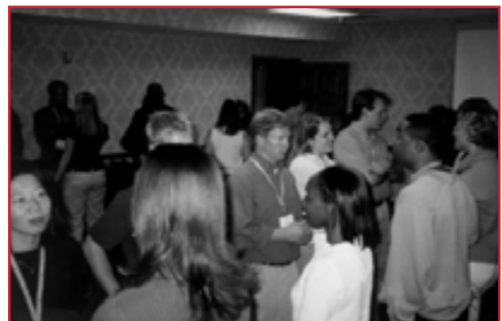
PT students from Howard University in Washington, DC join UW-Madison PT Students at the National Student Conclave in Milwaukee, WI.