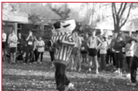
Bucky runs for rehab