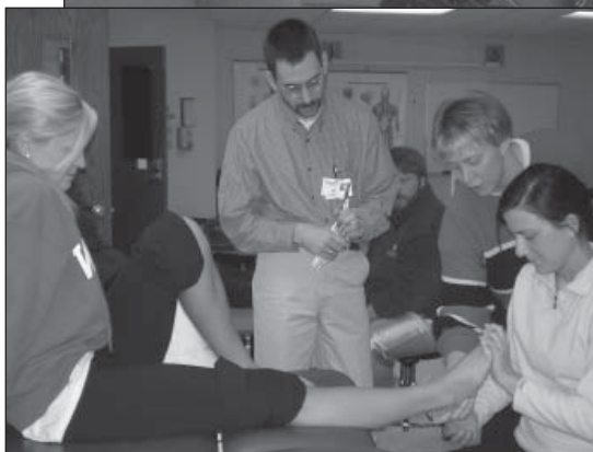
(Above) PT students learn first-hand from a community member with paraplegia. (Left) PT students practice foot and ankle examinations.