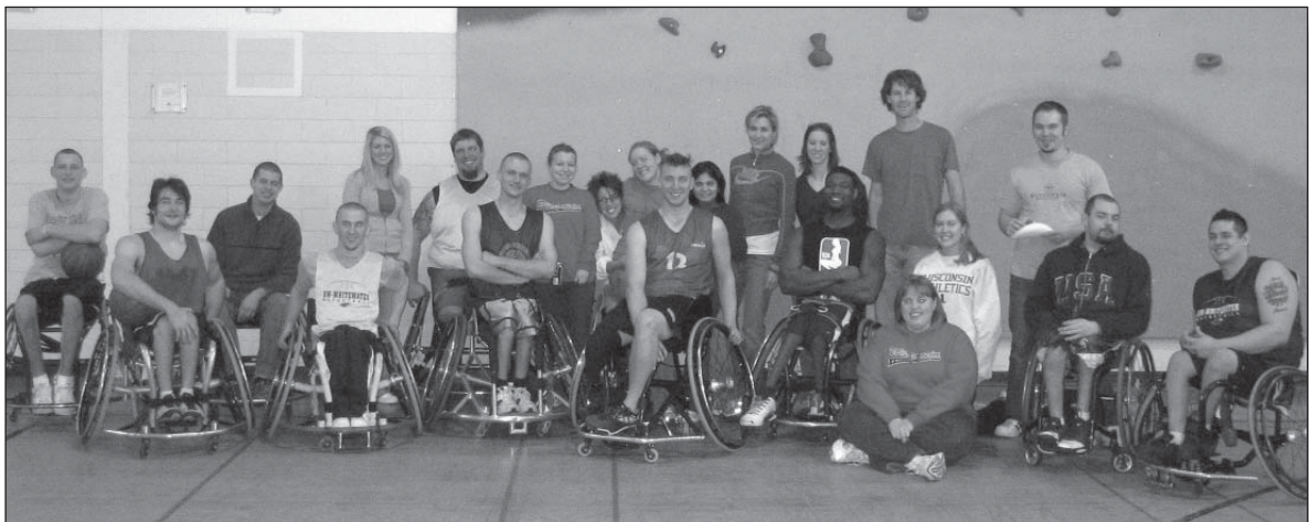
PT students visit the UW-Whitewater wheelchair basketball team.